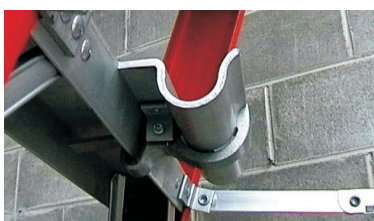
Rung Lock Assembly