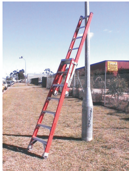
Adjustable Pole Ladder