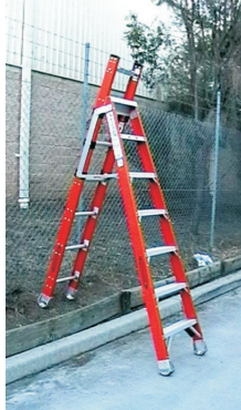
Adjustable Stair Stepladder