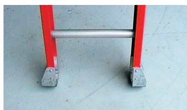
Wide Body Rear Feet