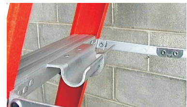
Rung Catch Step And Lock