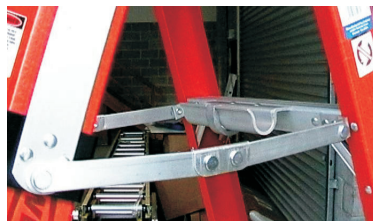
Heavy Duty Spreader Bars