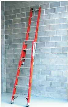
Adjustable Extension Ladder